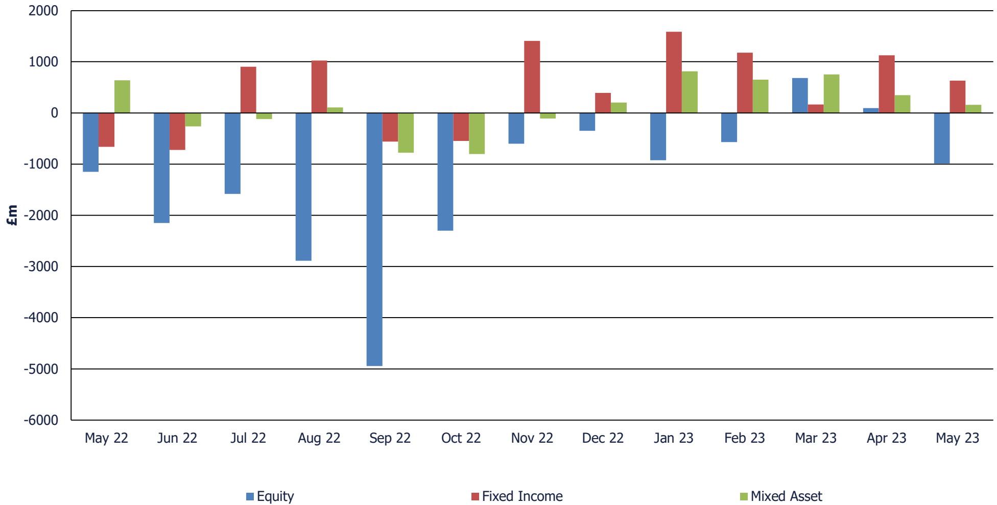
CHART B: NET RETAIL SALES BY ASSET CLASSES (UK DOMICILED FUNDS)