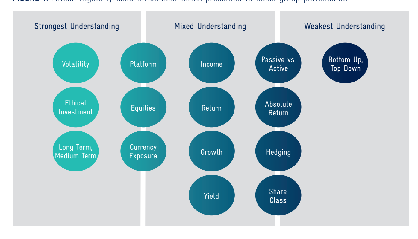
FIGURE 1: Fifteen regularly used investment terms presented to focus group participants

As part of the qualitative focus groups consumer testing, participants were presented with regularly used investment terms and showed varying degrees of understanding. Figure 1 highlights some of those terms by degree of how well understood these were: